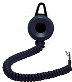
Ex II additional earpiece