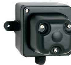
Ex II secondary sounder